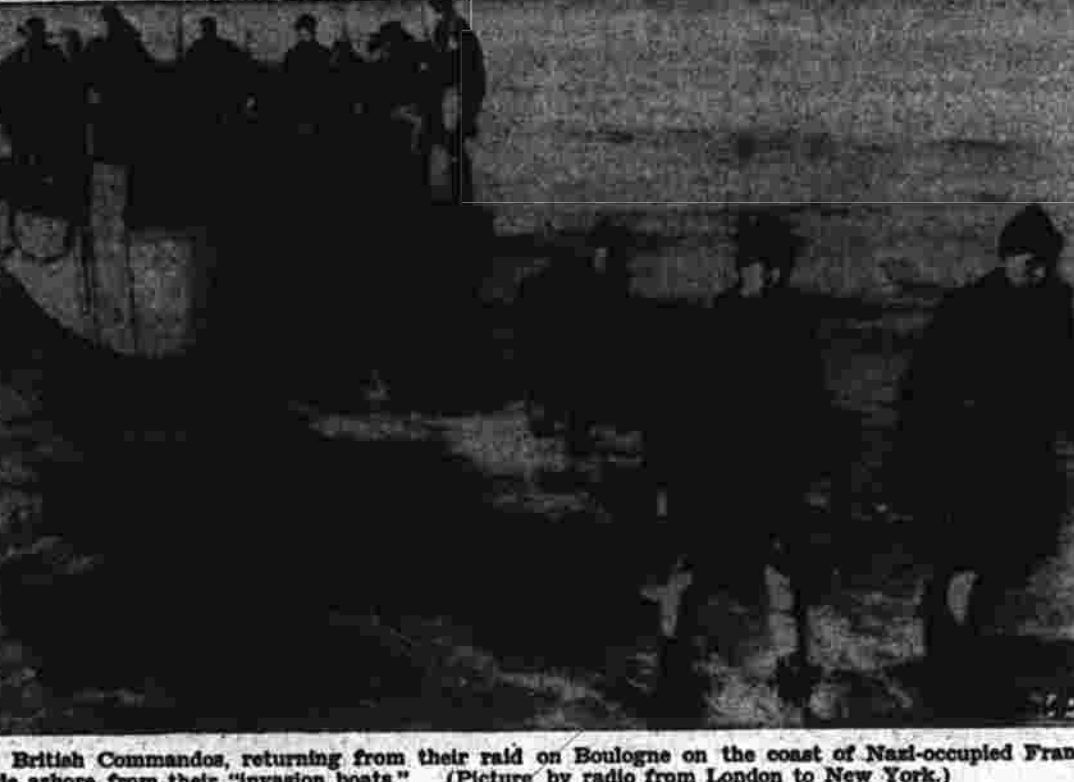
British Commandos, returning from their raid on Boulogne on the coast of Nazi-occupied France, made ashore from their "invasion boats." (Picture by radio from London to New York.)